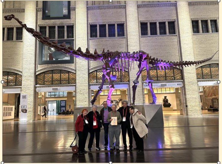
Exhibition: Being and Belonging: Contemporary Women Artists from the Islamic World and Beyond